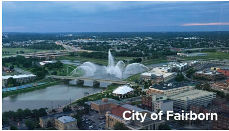
City of Fairborn