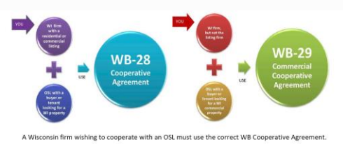
A Wisconsin firm wishing to cooperate with an OSL must use the correct WB Cooperative Agreement.